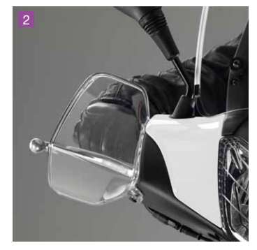
2 Knuckle Protector Set Set of two clear polycarbonate Knuckle Protectors that attach to the fairing and further improve wind protection without hindering visibility.