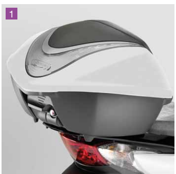
1 35L Top Box Offering 35L of carrying capacity to store a full-face helmet or two open-face helmets, this 35L Top Box is quick-locking and easily detachable. Complete with Backrest Pad.