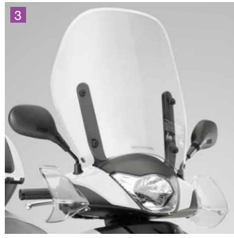
(incl. Knuckle Protectors) Offering complete protection against the elements without hindering visibility, this polycarbonate High Windshield with clear Knuckle Protectors has been specially engineered for the SH125i. Dimensions: 445 × 500 × 3mm.