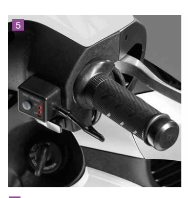
5 Heated Grip Kit

This patented, heat-adjustable, Heated Grip Kit will be sure to keep your hands warm on those chilly days. Its integrated circuit automatically protects the battery from draining.