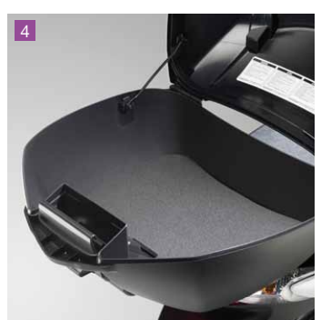
Top Box Mat Set A black mat to protect the interior base of the 35L Top Box.